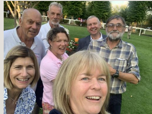
Terrible selfie!! Sorry.... A few members that attended